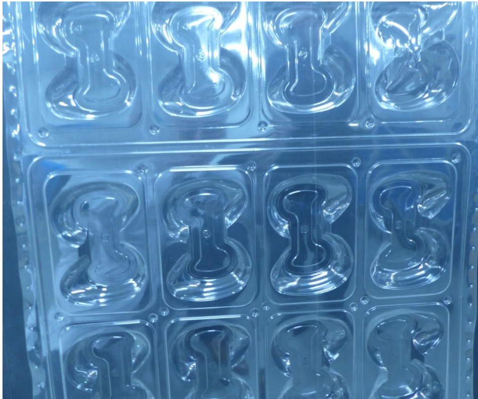
Sheet with formed products