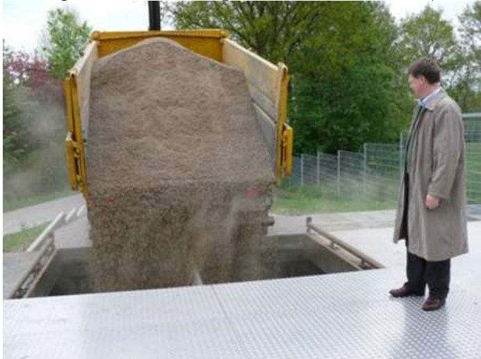
Figure 5. Delivery of Ukrainian reed pellets for test firing at the municipal heating plant in Marum, The Netherlands in spring 2013.

The quality of reed is potentially much better than for (summer harvested) straw because K and Cl have been washed out of the reed during winter. Thus ash melting and fouling problems can be reduced or avoided by harvesting reed in winter or early spring. The total ash content can still be a problem and require adaptations to boilers and good production chain management. The viability of reed pellets for thermal conversion was shown by a reasonably successful test in the municipal biomass heating installation in Marum (the Netherlands) in the spring of 2013.