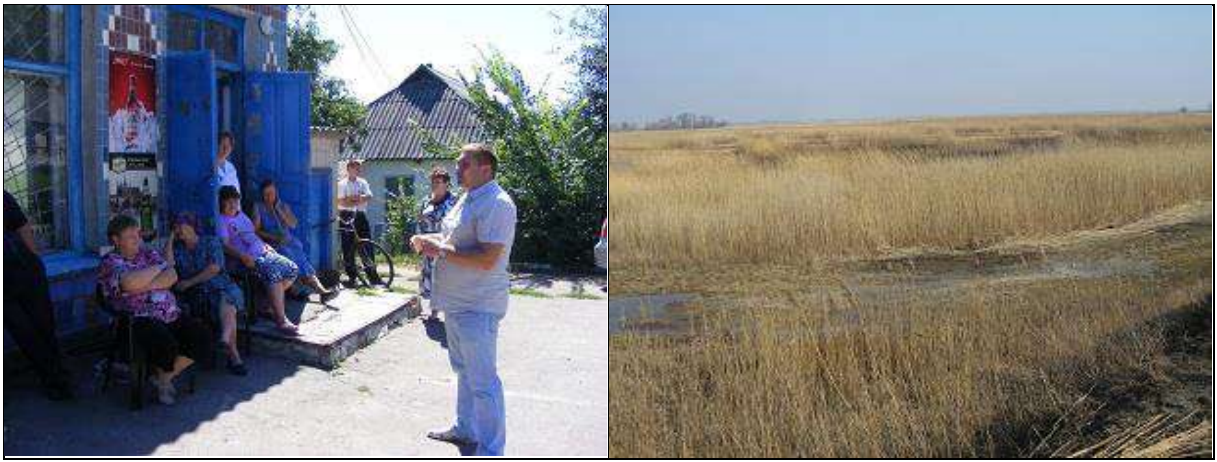
Figure 15. Phytofuels engaged with stakeholders. Phytofuels had to solve the unclear judicial status of reed land ownership before obtaining the reed harvesting concessions.

This report is an account of experiences of a Ukraine based company, Phytofuels Investments, operating in the framework of the Pellets for Power project. This project was carried out in Ukraine and funded by NL Agency under the Sustainable Biomass Import program in the Netherlands. The project aims at developing models for sustainable biomass supply chains, including production, processing and commercialization of reed, straw and biomass crops for energy purposes. So as to guarantee sustainability, all biomass operations were designed in accordance with the Dutch NTA 8080 standard. As one of five project partners, Phytofuels' tasks included the development of sustainable reed production methods. Two aspects of this endeavor are zoomed in on in this report: reed legislation and engagement with authorities issuing permits on the one hand and engagements with local reed owning communities on the other. Both aspects are strongly interlinked and cover two sets of requirements in the NTA 8080, i.e. compliance with national legislation and performing stakeholder consultations.