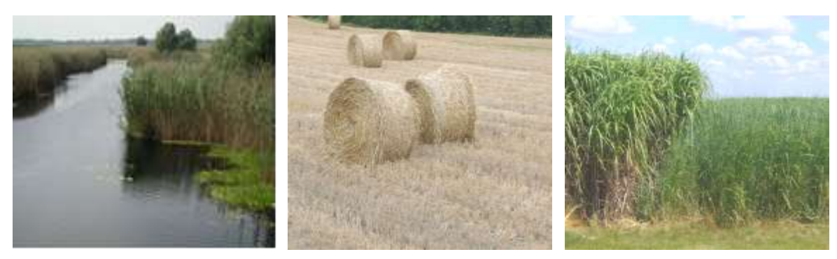
Figure 13. Reed, straw, switchgrass

This report describes the supply chain performance for three types of biomass feedstock (Figure 13) and for three sustainability aspects, i.e. the greenhouse gas balance, economics and Indirect Land Use change effects (ILUC). Calculations are based on a fictional supply chain setup, as no large-scaled commercial biomass operations have been initiated yet by the project partners. The analysis was performed for use of biomass pellets both on the domestic energy market and the Dutch electricity market, in four different supply chain configurations. Scenario 1 is the use of pellets for the domestic heating market, in this case for the town of Lubny. In the other scenarios the biomass is exported to the Netherlands for electricity generation. Scenario 2 involves transporting of biomass pellets from the production site by train to the city of Kherson and subsequent transport by sea vessel to Rotterdam. Scenario 3 is pellet transport by train to Izmail and further transport by river barges to Rotterdam. Scenario 4 is transport by truck from Ukraine directly to the Netherlands.