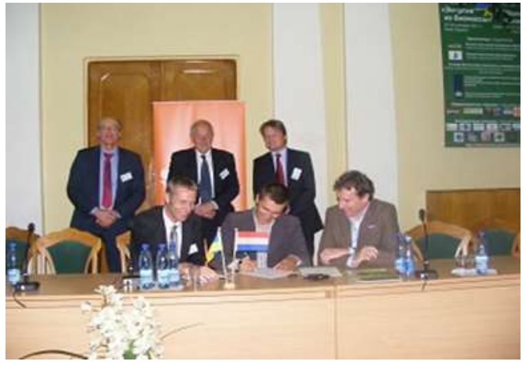
Figure 9. NTA 8080 promotion event in Kyiv, September 2012

One of the objectives of the Pellets for Power project was to align biomass operations with the NTA 8080 standard. With no functional supply chains developed during the course of the project, a complete conformity assessment, covering all NTA 8080 provisions, was not possible. For the remaining provisions, the project has had to rely on assumptions based on fictional but realistic supply chains as planned by the project partners with emphasis on the reed chain. With project partners successfully obtaining reed harvesting permits, reed became the most realistic resource for development in the short term and conformity of the proposed reed chain set-up was analysed against NTA 8080 certification system. Generally, the analysis shows that NTA 8080 certification for reed based pellets, under our set-up, should in principle be possible in Ukraine.