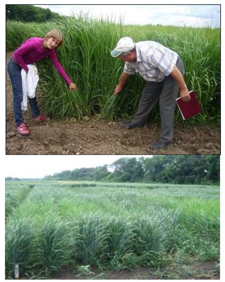
Figure 6. Switchgrass row spacing experiments in Yaltushka, Ukraine.

Switchgrass is now an option for large scale biomass production, though testing should be continued to optimise production practice, reduce cost and also focus on delivery biomass of the right quality for thermal conversion.