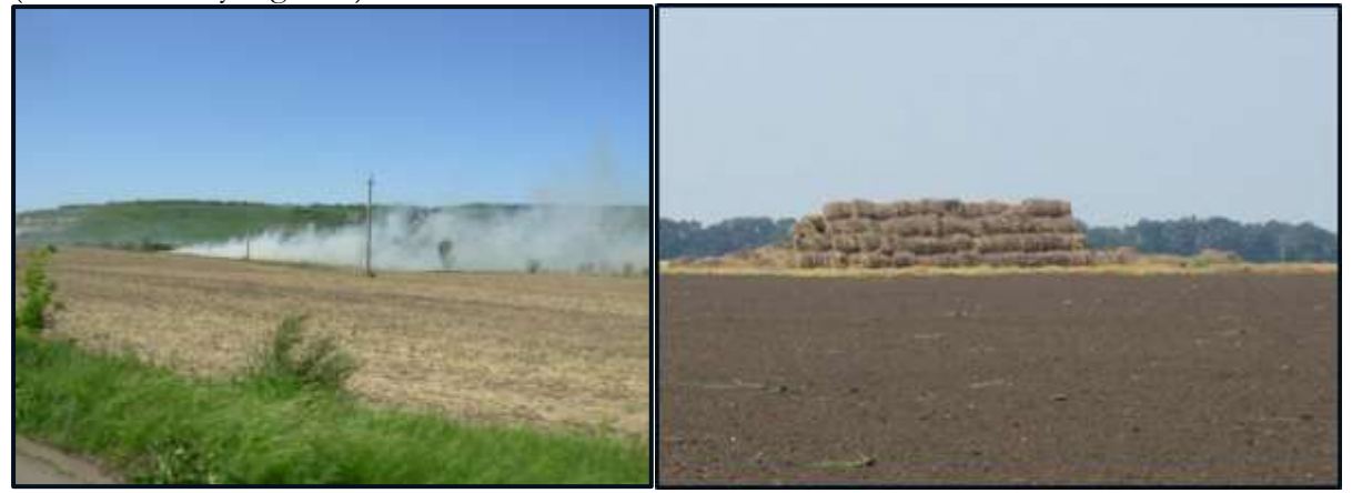
Figure 2. Straw has few alternative uses in Ukraine and burning in the field is still common.

The straw potential in Ukraine is very large. Some 10 million tons of DM is assumed to be available every year, mainly because few alternative uses such as animal bedding or other applications like mushroom production or card board production are available. Because it is a by-product a positive GHG balance is very likely. In current practice straw is often burnt in the field (as illustrated by Figure 2).