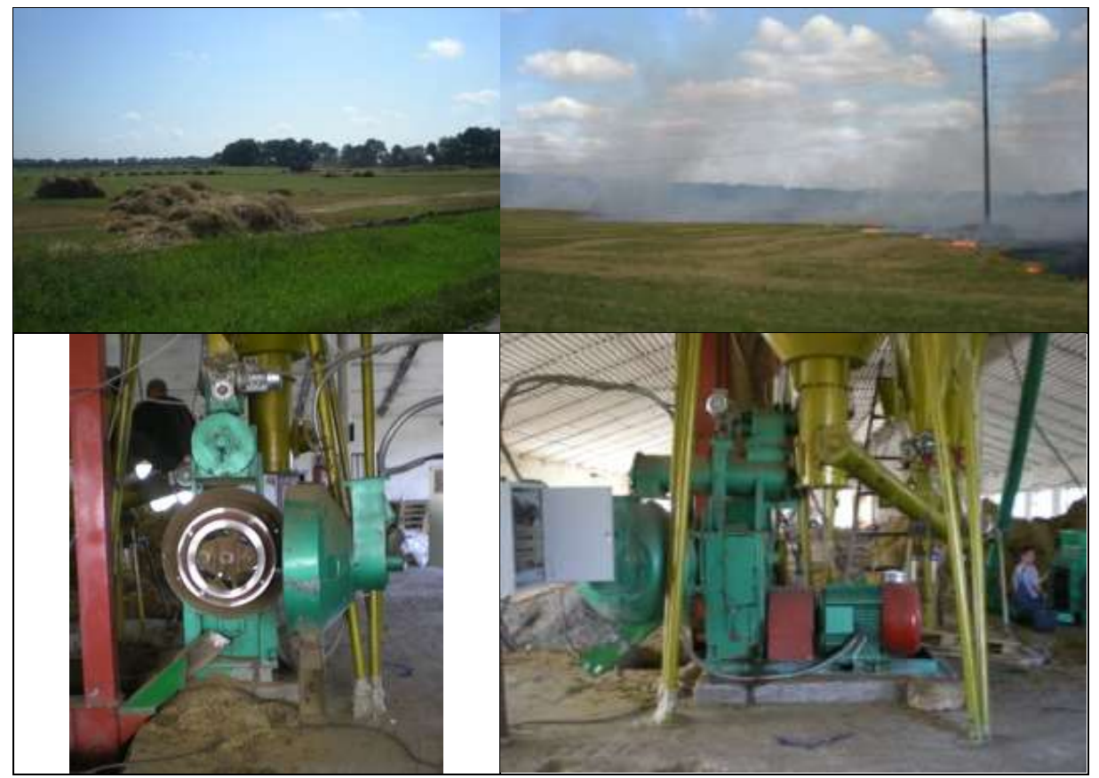
Figure 14 . Tuzetka first focused on pelletisation of straw and export to Poland as illustrated in the pictures here showing how straw is currently often burned in the field and how it is pelletized in a small scale local pelletization plant.

The Pellets for Power project, funded by Agentschap NL under the Sustainable Biomass Import program, is defining ways for sustainable biomass production in Ukraine. It is focused on three biomass sources: straw, switchgrass and reed. However, so far commercialization of Ukrainian non-wood biomass has not been successful.