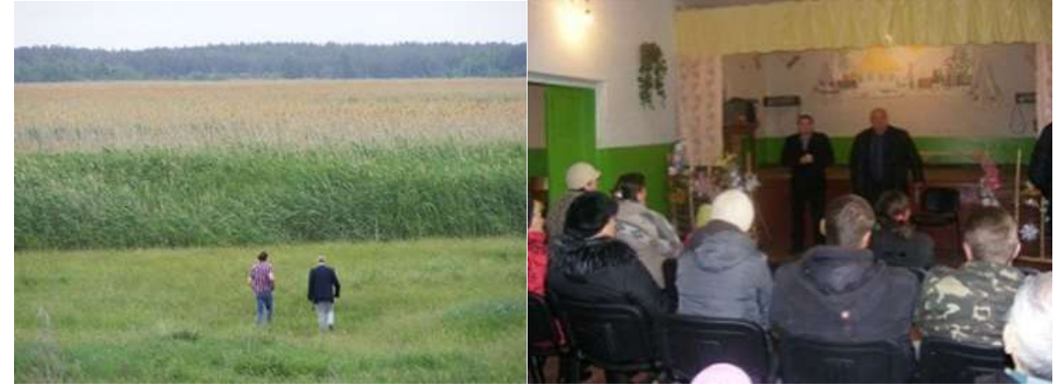
Figure 4. Reed fields in the Poltava oblast and presentation held by Phytofuels about the reed for energy project to villagers as part of the stakeholder consultations.

concessions from the local communities could be obtained<sup>3</sup>. This effort should also benefit other initiatives focusing on certified reed harvesting for energy purposes in Ukraine.