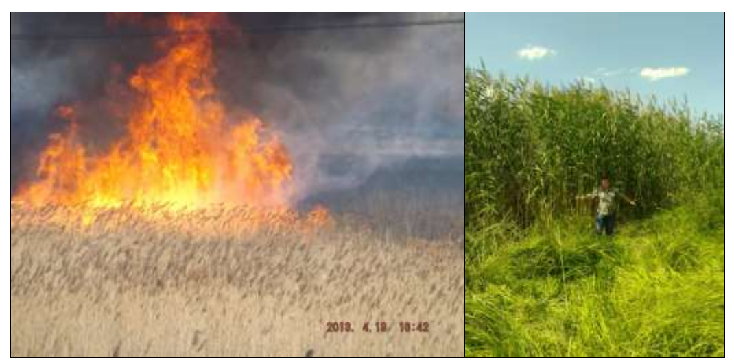
Figure 12. Reed is currently often burned in winter to get access to make hunting and fishing possible. Reed is often more than 4 meters high illustrating the high productivity of the system.

Stakeholder consultation is an essential element in developing, implementing and operating a biomass project. It plays a critical role in awareness raising of the project's impacts and helps to achieve agreements on the approach. The report describes how the consultation took place, and what problems were encountered in this process. The community consultations have resulted in broad support within the community, making the project at the same time less vulnerable to corruption and abuse by individual village council members and officials. Long-term reed harvesting programs were signed with thirteen villages.