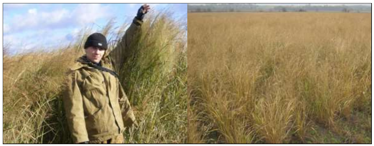
Figure 8 . Switchgrass in Ukraine has been shown to be quite productive as illustrated by the crop height, with an expected yield of up to 15 tons per ha. Right large scale field > 5 ha established in the Lviv region in fall of the first year.

Switchgrass establishment is inexpensive because it is propagated by seed. Establishment is also difficult due to slow growth in spring, when weeds will outcompete switchgrass and risk of drought later in the season. Optimizing seedbed preparation, exact placement of the seed and using the right weed management will generally lead to a good switchgrass stand that should last for 15 years or more under good management practices.