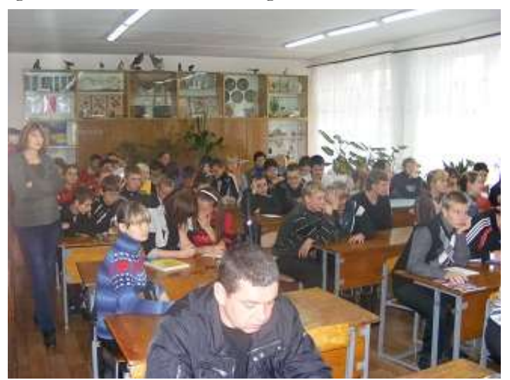
Figure 10. Phytofuels engaging with village people

First the legal issues were addressed. Project partner Phytofuels identified Ukrainian laws and legislations regarding the right to use Reed biomass in conformity with the NTA 8080 principles. This focused on analysis of reed legislation and permit procedures and on how to obtain licenses and for mobilizing community ownership for legal reed harvesting. This was essential for the stakeholder consultation process, which resulted in broad support within the community, making the project at the same time less vulnerable to corruption and helped to acquire the permits and agreements for reed harvesting.