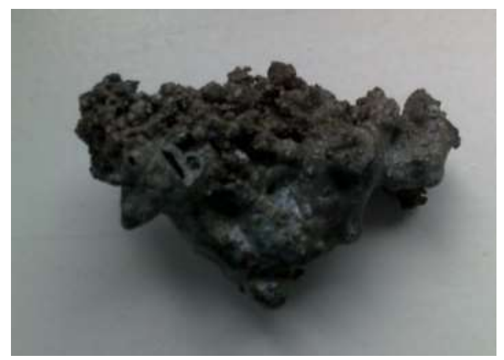
Figure 3. Melted ash from a straw burning boiler in Ukraine.

On top of this a model study, in the project<sup>2</sup>, showed that under current conditions the harvest of straw without decreasing the soil carbon is not possible in most cases for the project area (Poltava, Ukraine). This is due to the high soil organic carbon contents of the soils in Poltava, making it very difficult to maintain soil organic carbon levels when used for arable agriculture. Especially given the low cereal yields and consequently low input of carbon through the roots and the stubbles and the low input of other organic matter like manure. The potential for straw harvesting can be increased by increasing cereal yields and more manure application. Maintenance of soil organic carbon is most critical NTA 8080 criterion for the straw chain.